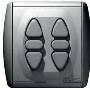
Hold-to-run dual pole switch for operating two shutters