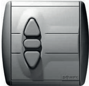
Hold-to-run single pole switch for operating one shutter