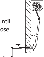
Internally installed shutter with external manual override

Remove lock and insert crank handle and rotate until door reaches the open/close position.