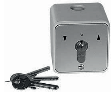
Hold-to-run single pole key switch for operating one shutter